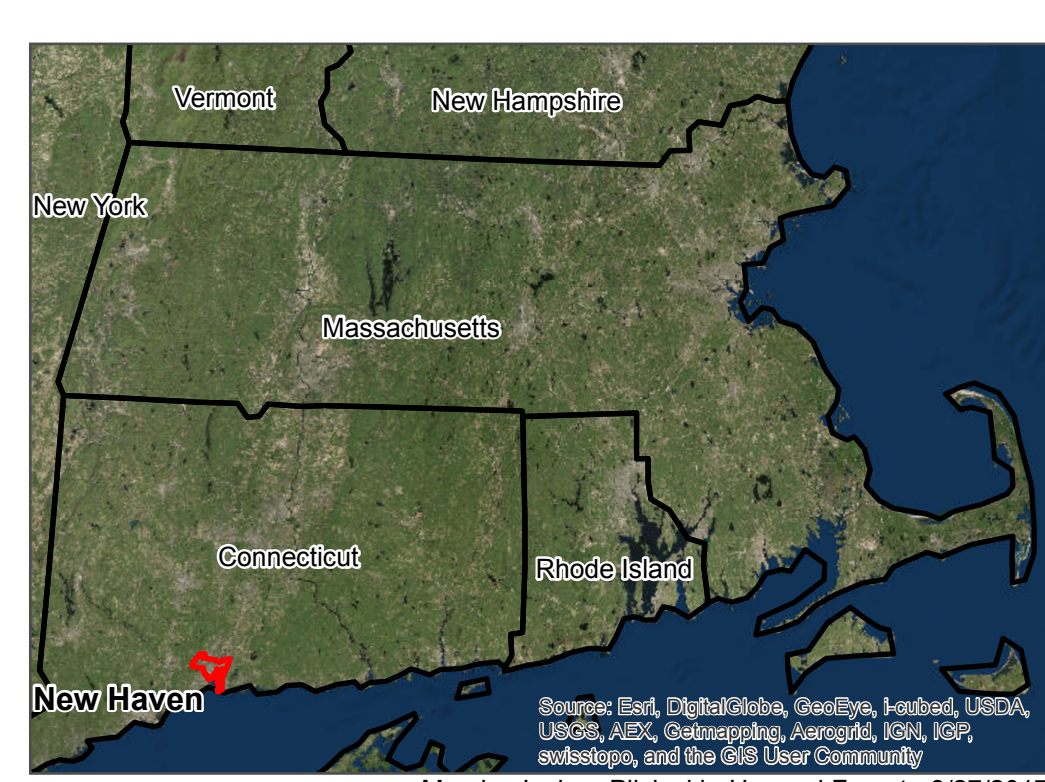
Map by Joshua Plisinski - Harvard Forest - 3/27/2017