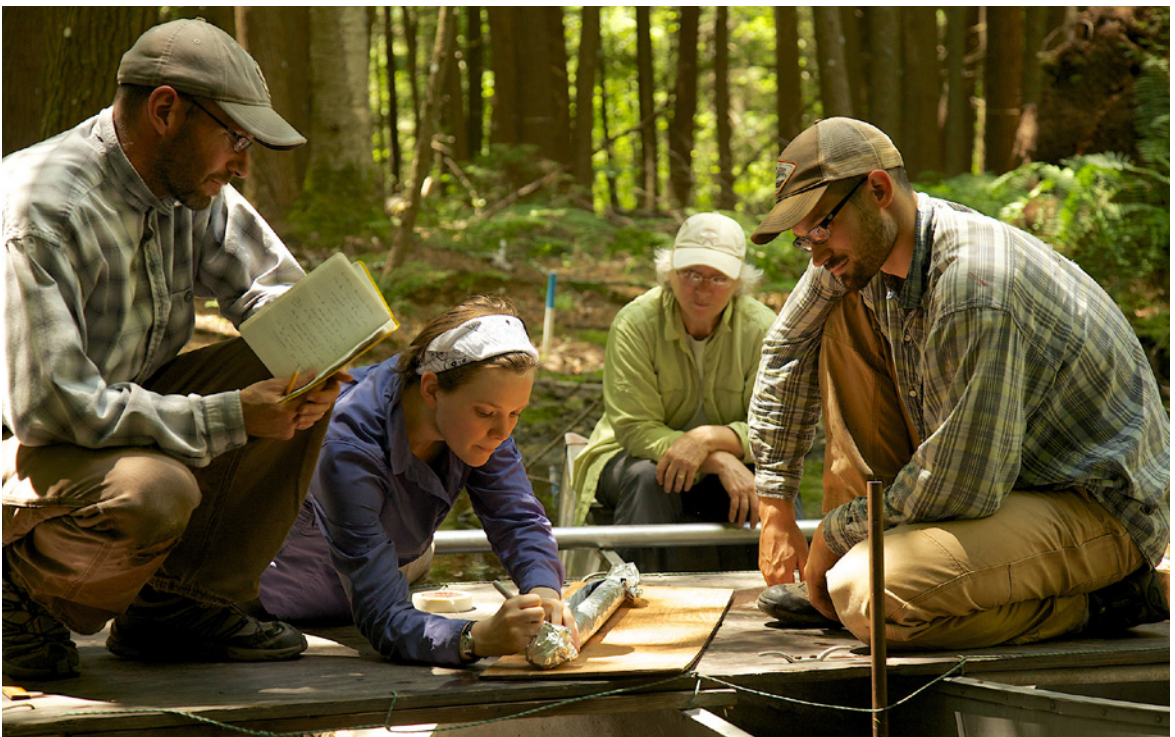
An extracted sediment core is finished and labeled by researchers.