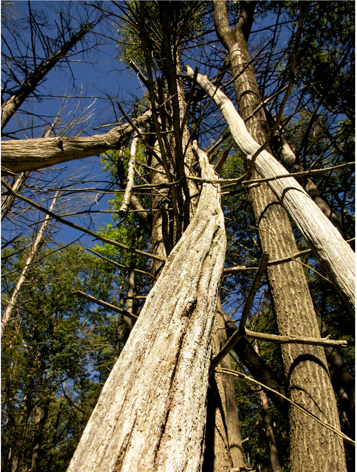
Dead trunks of American chestnut ( Castanea dentata ) intertwined with dying eastern hemlocks.