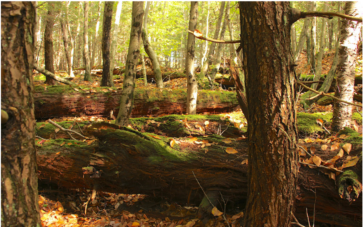
In Harvard Forest's Pisgah Tract in southwestern New Hampshire, old-growth eastern hemlocks and eastern white pines ( Pinus strobus ) that were blown down by the 1938 hurricane provide structure to the modern forest.