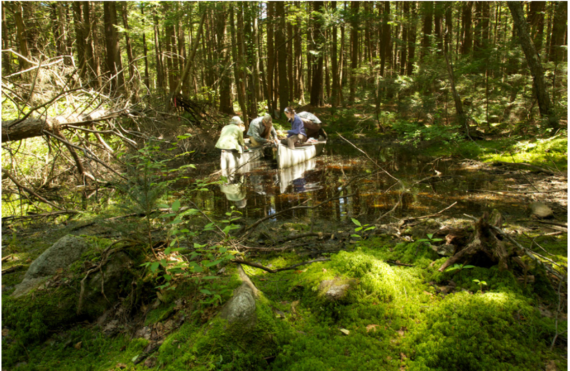
A view of Hemlock Hollow.