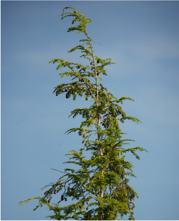
The top of an eastern hemlock ( Tsuga canadensis ) pokes above the canopy on the Prospect Hill tract of Harvard Forest.