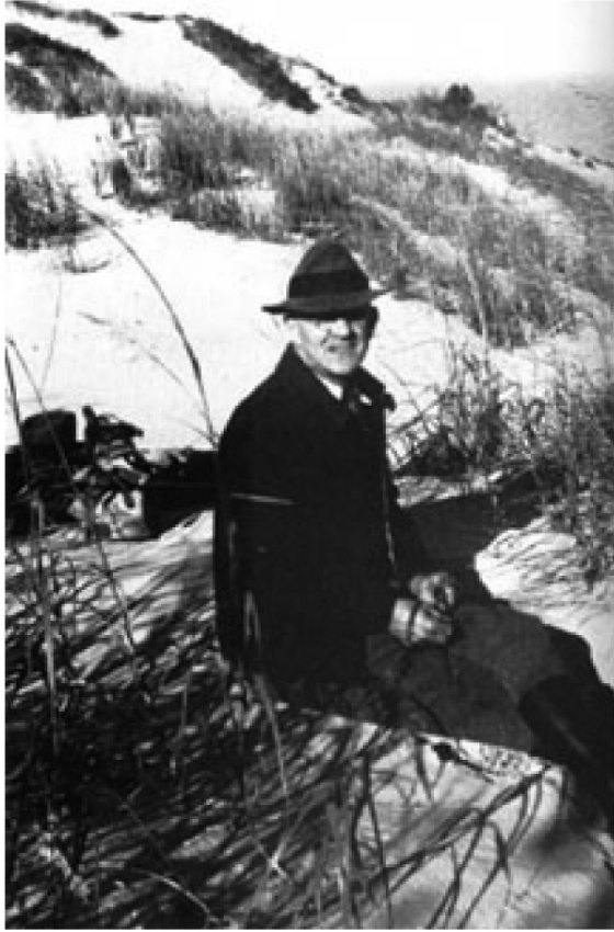
Fig. 6. Victor Shelford (1940).

others remain buried and unread in the pages of our journals? Should current upstarts aspire to iconic status? In his wide-ranging talk, Paul Dayton explored these central questions of the symposium by peering through the lenses of norms of scholarship, the peer review process, and dynamics of citation. A central nugget, attributable to Lamarck (1984 [1809]:404), is that