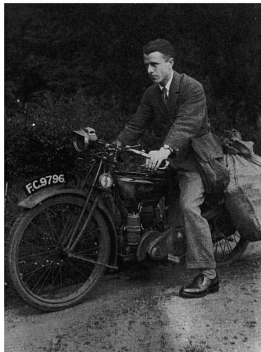
Charles Elton setting mouse traps in Bagley Wood, near Oxford, in 1926.

In the symposium, “What makes an ecological icon?” a group of seven ecologists and historians discussed individuals—some well known, some forgotten—who made substantive contributions to the development of fundamental ideas in ecology, including the following: the concept of food webs; invasive species and community assembly; the ecosystem concept; nonequilibrium dynamics; and the