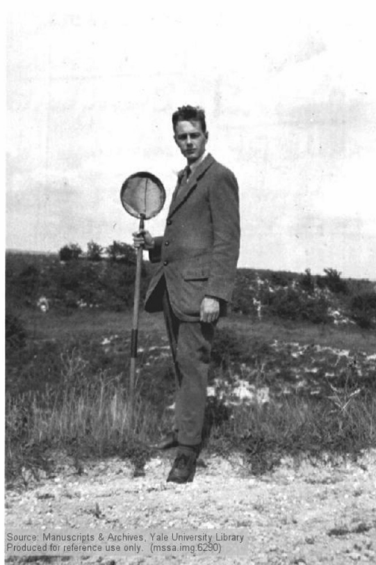
Fig. 5. G. Evelyn Hutchinson as a student in 1920 collecting the meadow spittlebug, Philaenus spumarius, Cherryhinton Chalk Rt, Cambridge. Both this photo and that of Elton (Fig. 1) attest to the decline in the quality of ecologists' attire since the early 20th century!