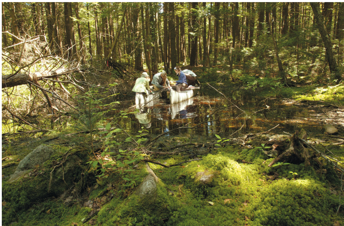
A view of Hemlock Hollow.