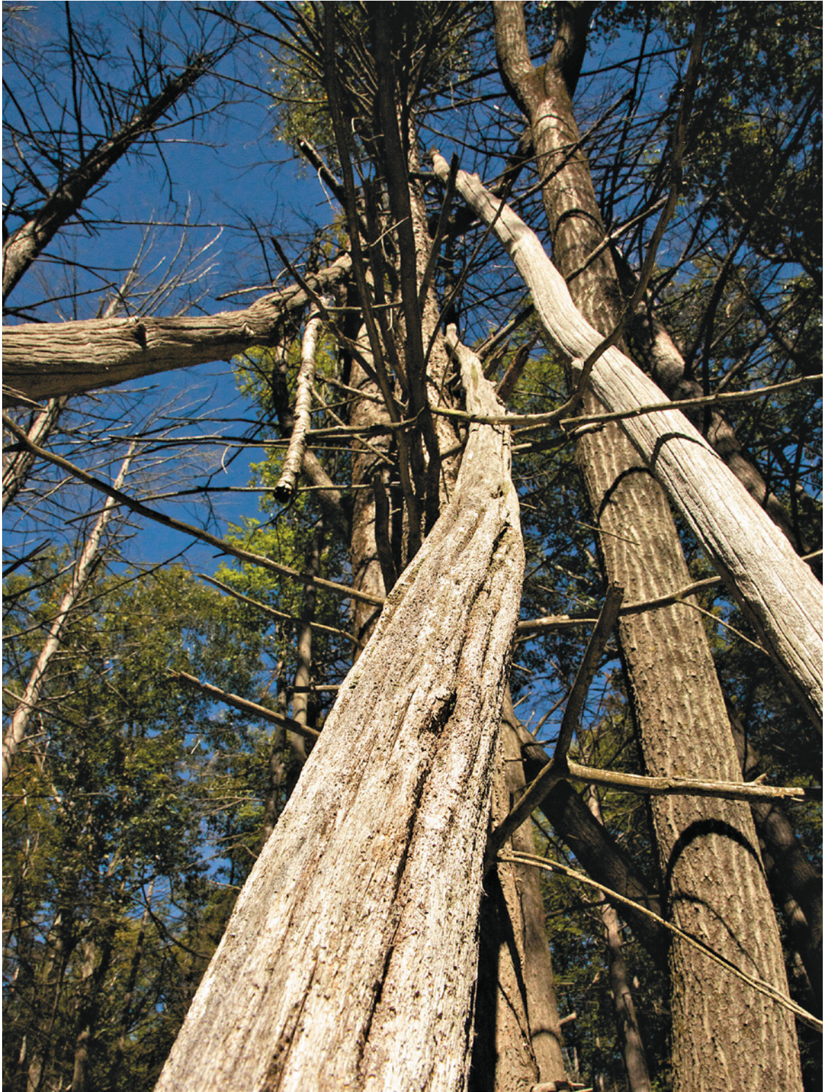
Dead trunks of American chestnut ( Castanea dentata ) intertwined with dying eastern hemlocks.