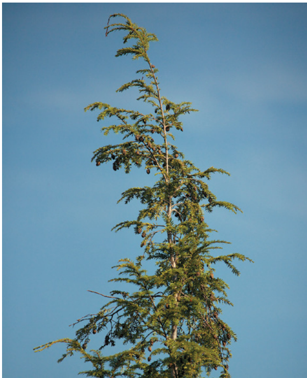
The top of an eastern hemlock ( Tsuga canadensis ) pokes above the canopy on the Prospect Hill tract of Harvard Forest.