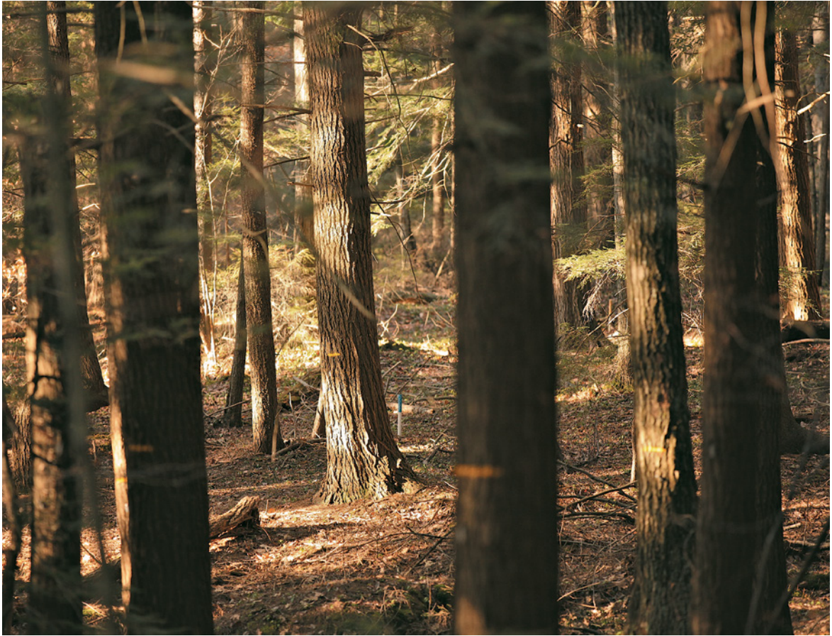
Old eastern hemlocks and eastern white pines in Harvard Forest's Prospect Hill Tract.

In northern Maine, spruce, balsam fir, and white cedar dominated the landscape. Moving slightly southward into the rest of Maine, New Hampshire, and Vermont, hemlock, beech, maples, and red spruce were common, even reaching down along the broad uplands of the Berkshires in western Massachusetts and Connecticut. Oaks, pines, hickories, and American chestnut picked up from there and were prevalent in the south and along the coast. In broad detail, this pattern closely parallels the regional environmental gradient, with cooler and moister conditions to the north and warmer and drier conditions to the south. Hemlock became less common farther south and was found in increasingly smaller concentrations. Near the coast it would only have occurred in isolated stands in protected moist areas.