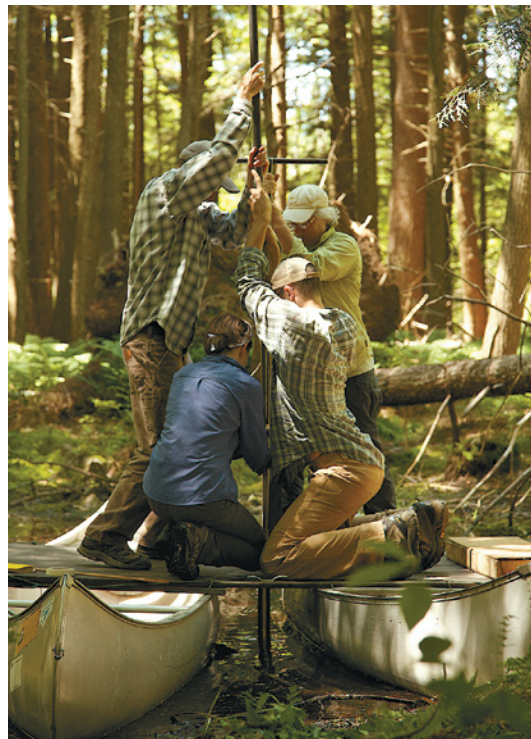
Researchers extract sediment cores from Harvard Forest's Hemlock Hollow.