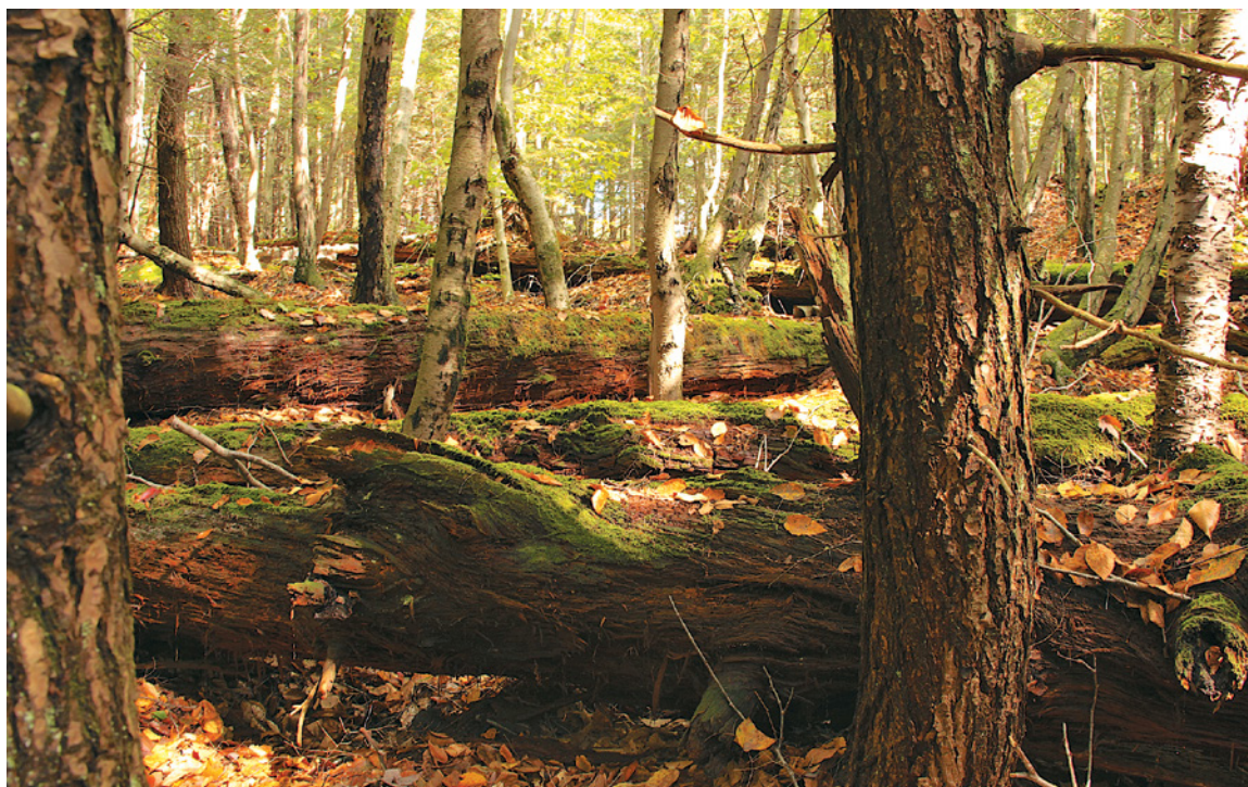
In Harvard Forest's Pisgah Tract in southwestern New Hampshire, old-growth eastern hemlocks and eastern white pines ( Pinus strobus ) that were blown down by the 1938 hurricane provide structure to the modern forest.