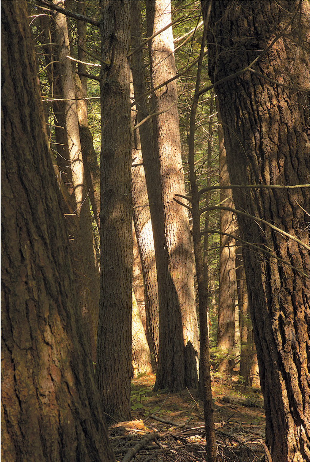
Eastern hemlocks and eastern white pines along the Swift River in Petersham, Massachusetts.