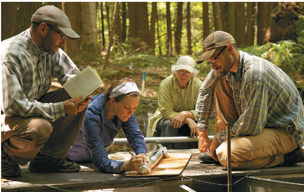
An extracted sediment core is finished and labeled by researchers.