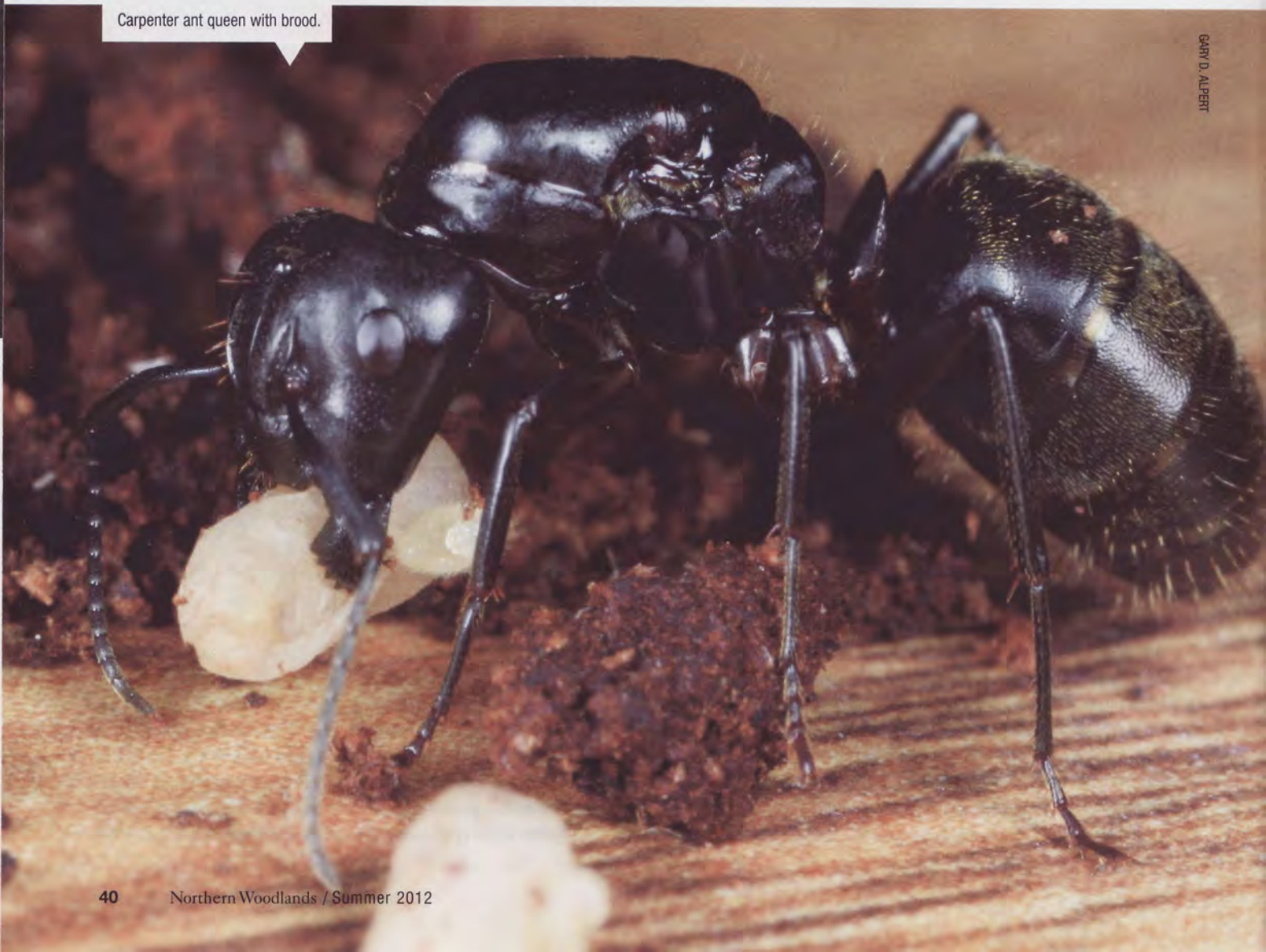
Carpenter ant queen with brood.