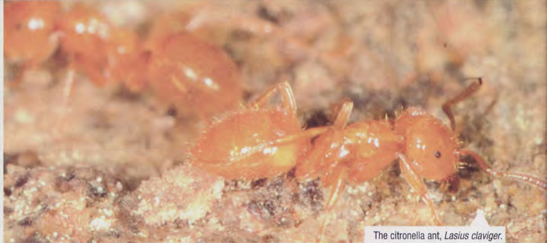
The citronella ant, Lasius claviger .