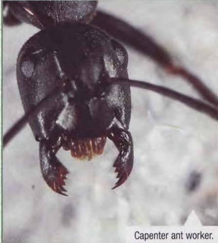
Carpenter ant worker.