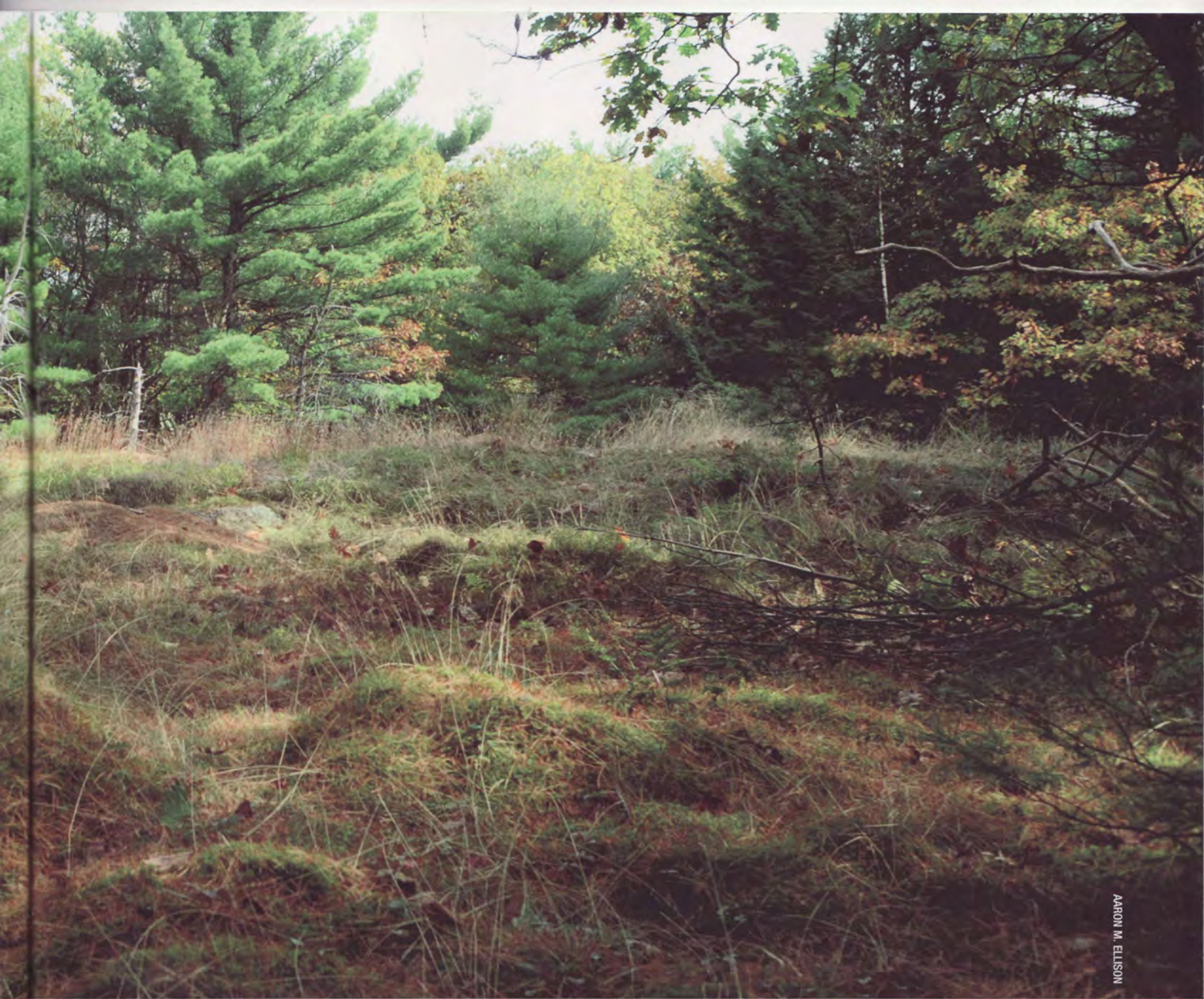
ARON M. ELLISON

inch diameter or larger) oaks, walnuts, or hickories in mature hardwood forests of the Northeast. As old-growth hardwood forests have disappeared from our region, these ants have become quite rare. In fact, out of nearly 30,000 collection records of ants in New England, we know of only one of Aphaenogaster mariae , eight of Camponotus caryae , and 31 of Temnothorax schaumii .