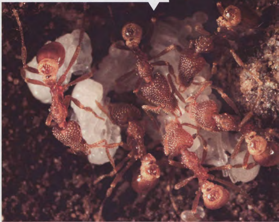
We call the beautiful Pyramica pergandei the Lady Gaga ant because of its flamboyant outfit featuring a lacy "skirt" around its abdomen.

nutrients wrapped up within them, and blending it all together into fertile soil. In short, it's the ants that mulch our soils and stock our larders. Perhaps we can spare them a teaspoon of sugar!