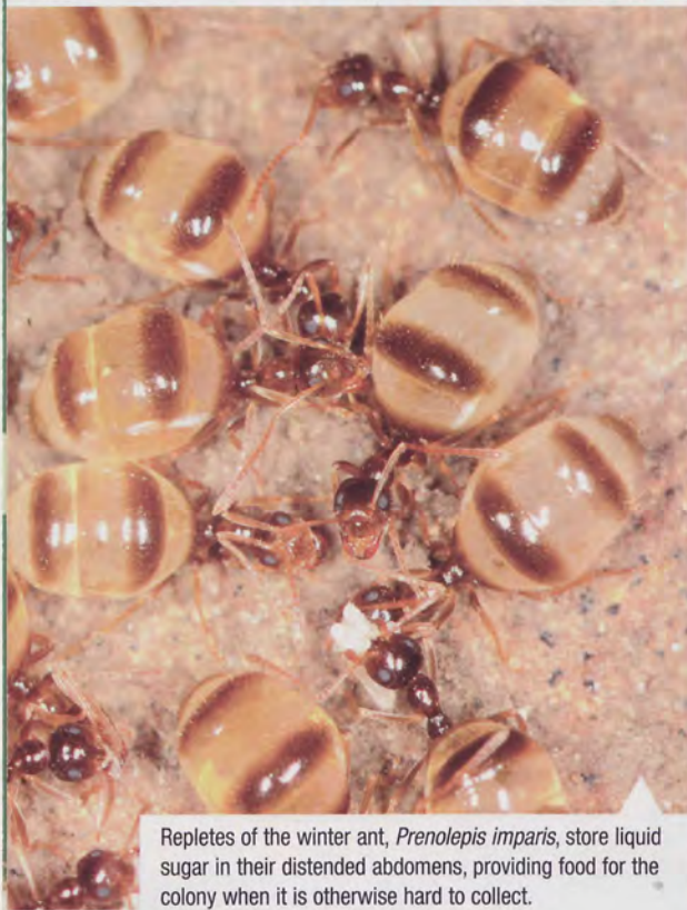
Repletes of the winter ant, Prenolepis imparis , store liquid sugar in their distended abdomens, providing food for the colony when it is otherwise hard to collect.